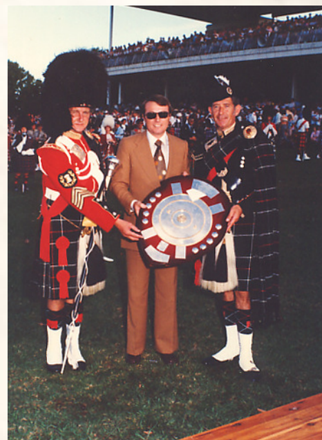
The City of Wellington Pipe Band winners of the Australian Championships.