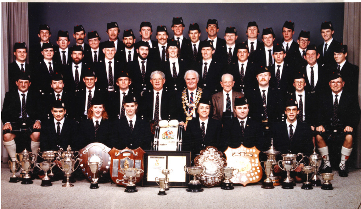
The City of Wellington Pipe Band Inc. 1989, 50th Jubilee Year, Combined No. 1 and No. 2 Bands.