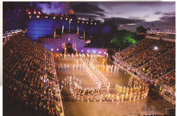
The 'Anchor' from the 2005 Edinburgh Tattoo.