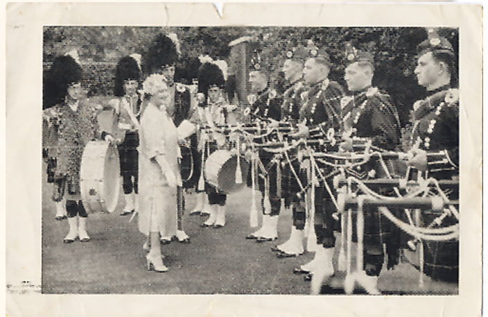
The City of Wellington Pipe Band meeting the Queen Mother.