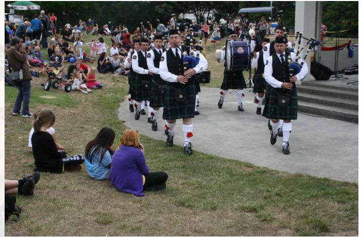
The Island Bay Festival 2010