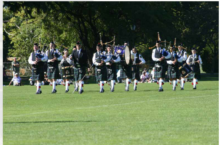
The Band playing at the Masterton Provincial Contest on the 20th February.