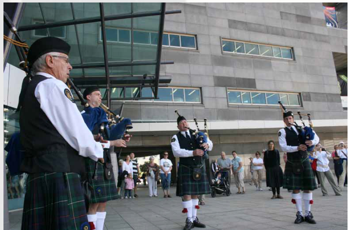
The Te Papa Scottish Exhibition closing event