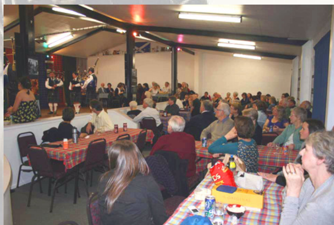
Gaelic Club Ceilidh

As promised, here is another photo from the 70th Anniversary, this is the 2000-2010 Band Photo.